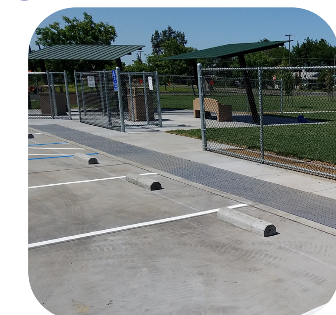
⑪ Off-Street Parking

DRAFT CONCEPT MASTER PLAN OPTION B - Estimated Cost $2.5 MILLION