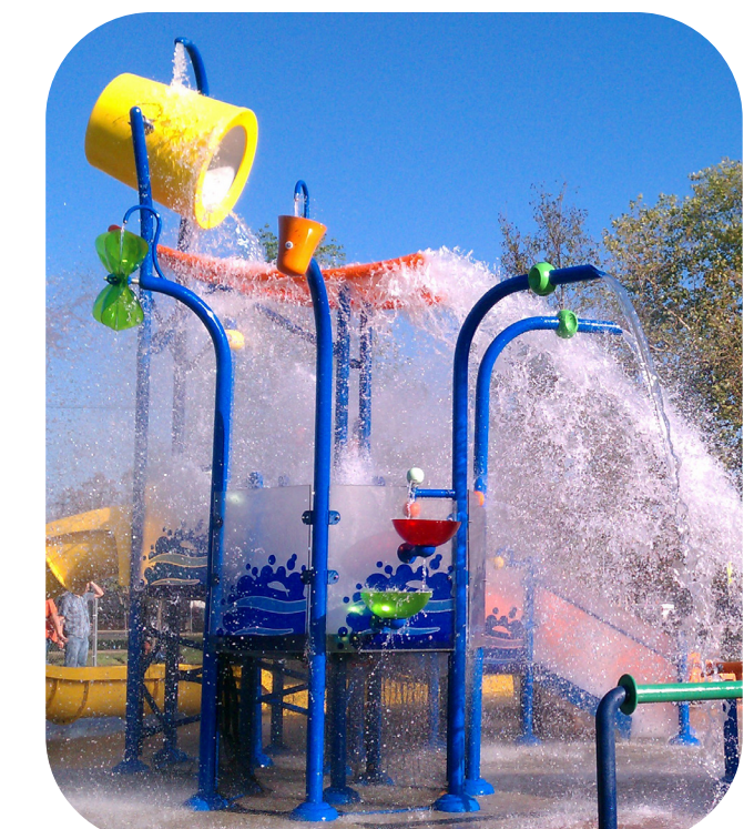
⑥ Waterplay Equip.