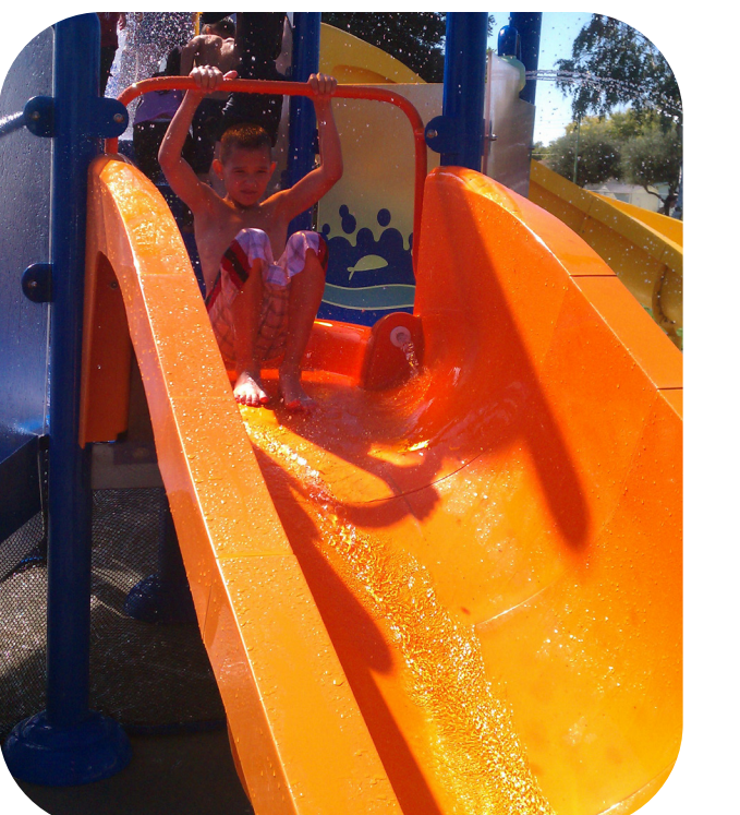
⑥ Waterplay Equip.