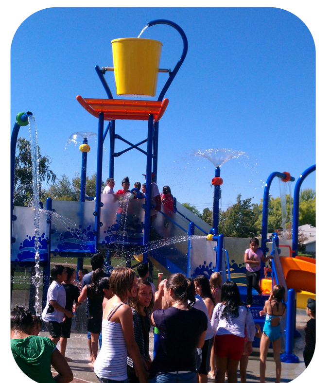
③ Waterplay Equip.