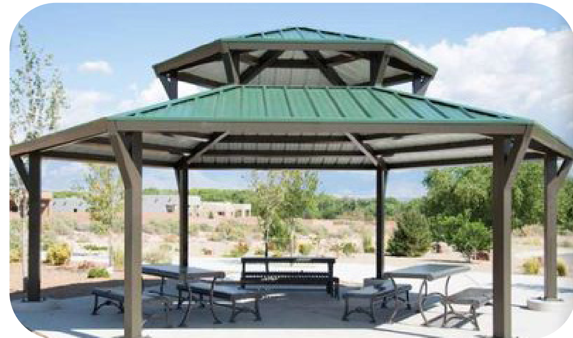
① Shade Structure Element