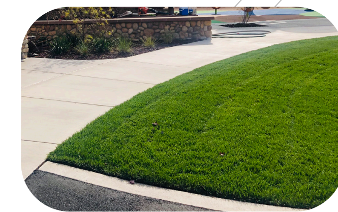
④ Courtyard Area