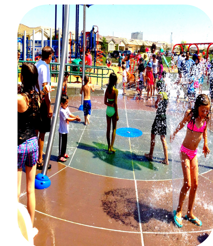
⑥ Splash Pad