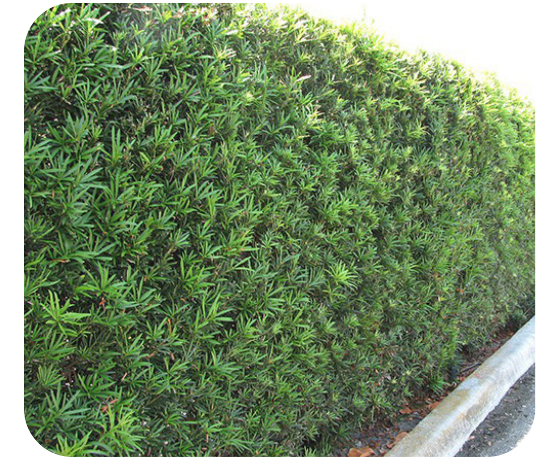
⑨ Landscape Hedge for screening