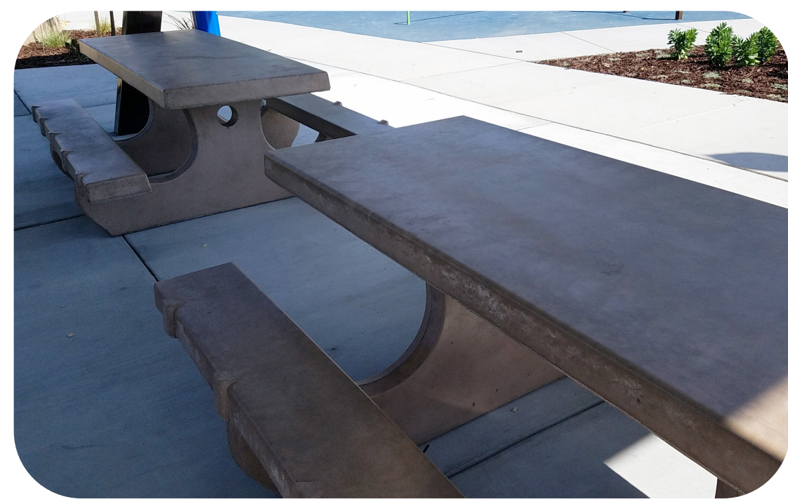
② Shaded Gathering Space w/ Tables