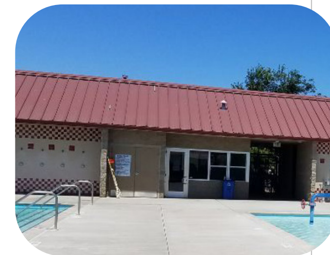
③ Courtyard Area